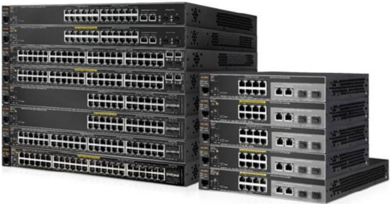
Aruba 2530 Switch Series

The Aruba 2530 Switch Series is easy to deploy, use and manage using Aruba AirWave or Aruba Central. Aruba ClearPass offers network access control (NAC) and external captive portal support. The switches include a Limited Lifetime Warranty.